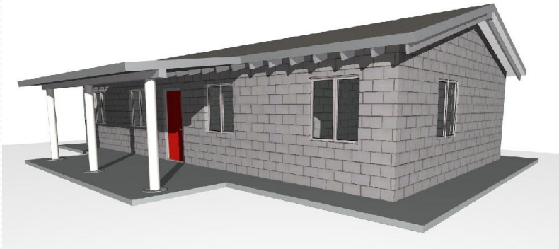
CLINIC 2 ENTRY 1